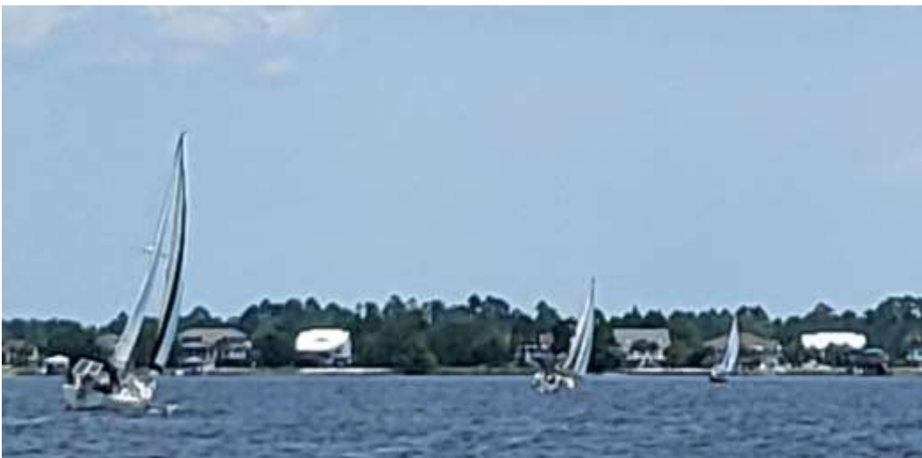
It is a 3 boat race as they head for marker 2