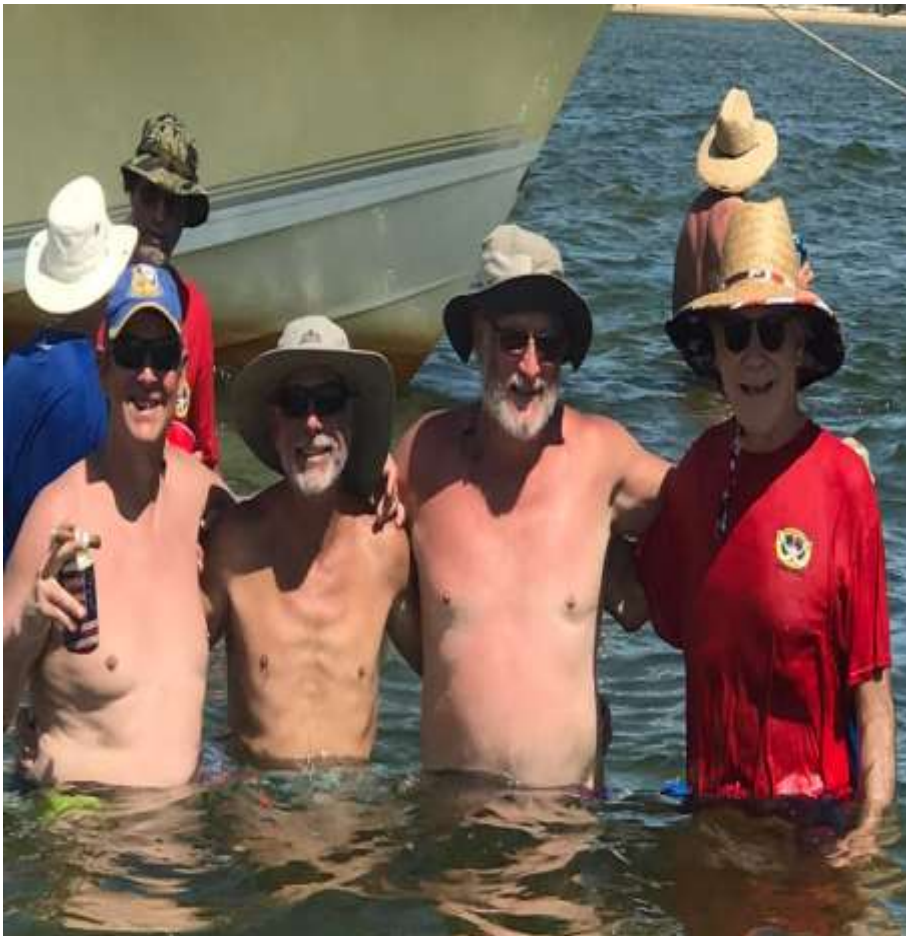
Pirate Captains doing what they do best!