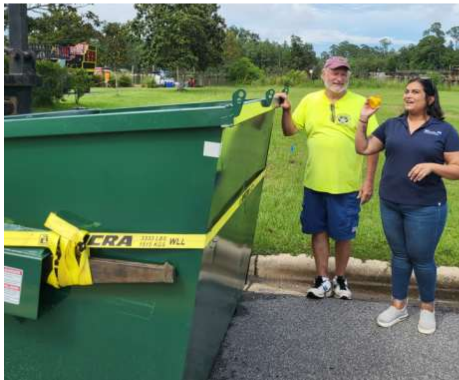
The Golden Duck officially enters the race

Incidentally, I have never witnessed the Golden Duck actually winning a race. Hmmm! I wonder if it has to do with the special treatment it receives all year. Instead of tireless hours training inside the Olympic swimming pool all offseason, the Golden Duck is treated with airconditioned spaces and meticulously cared for all year as we fatten him up like the Christmas Goose.