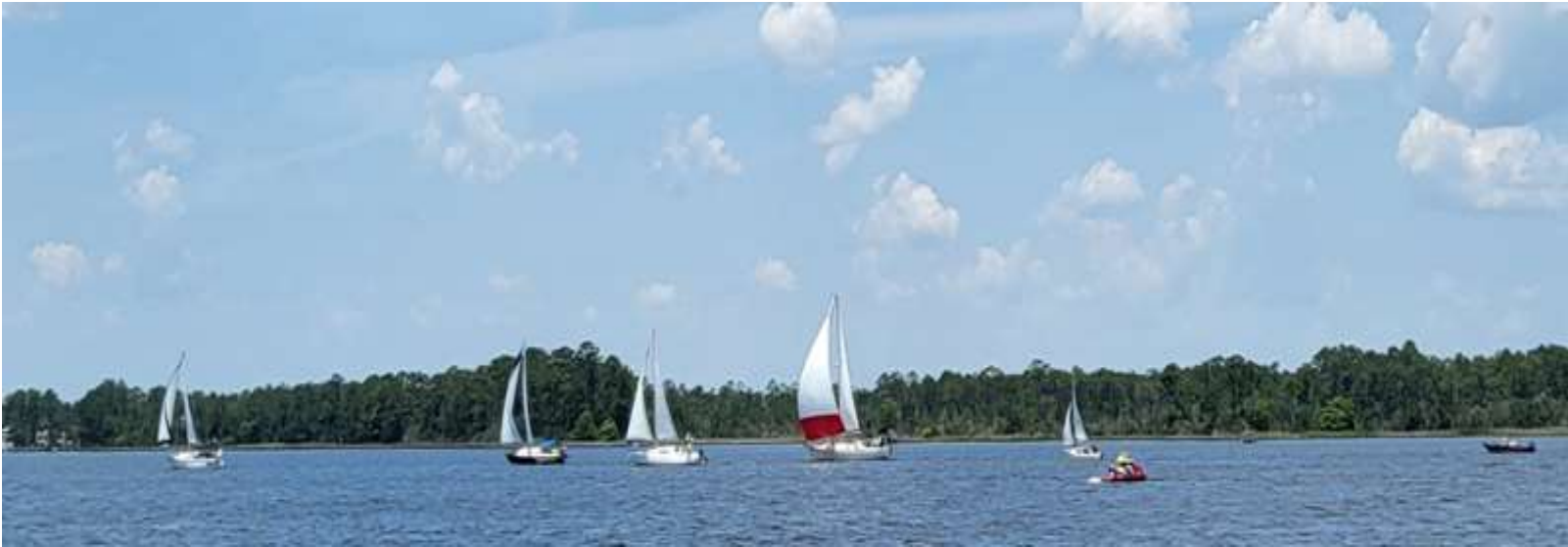
As the race begins, a couple of safety boats observe