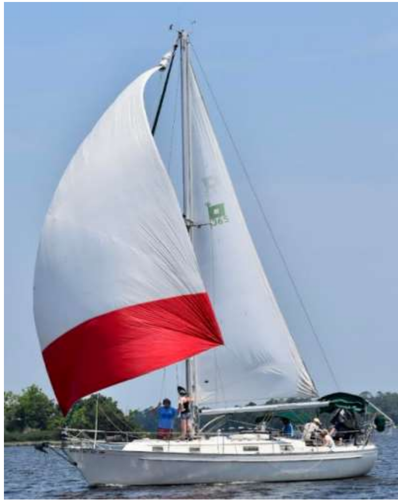
Woody and crew

This year's event did include some very steamy weather conditions as several observers, and some participants were negatively impacted by the heat.