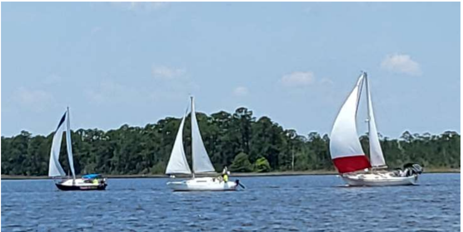
It's a 3 boat race!