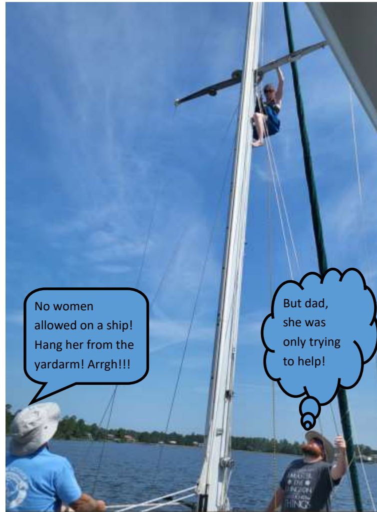
Woody and crew performing safety inspections