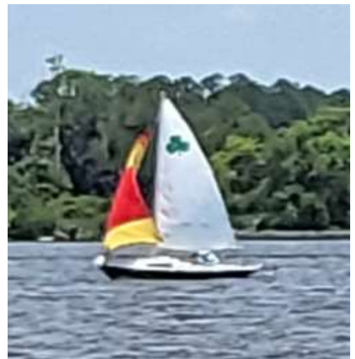
Eventually, Rumfront and Crew get racing