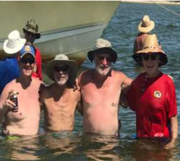
Pirate Captains doing what they do best!