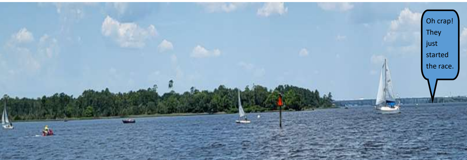
As the race begins, the field spreads out. Unfortunately, Rumfront and Crew are really spread out.