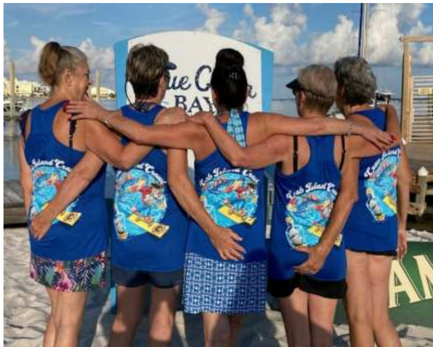
Vixen, Bear Claw, Partagas Princess, Devil Rae and SasSea enjoy the view

Led by an energetic group of winches (pictured at right), an armada of 5 ships and 25 Pyrates set sail from Navarre and headed east to Destin and the "shores" of Crab Island. Searching for additional booty (again, pictured at right) this hearty group enjoyed the usual Pyrate comradery as well as the crystal clear waters of Destin while soaking up the sun and suds. A Crab Island Crawl would never be complete without a few pudding shots and water aerobics.