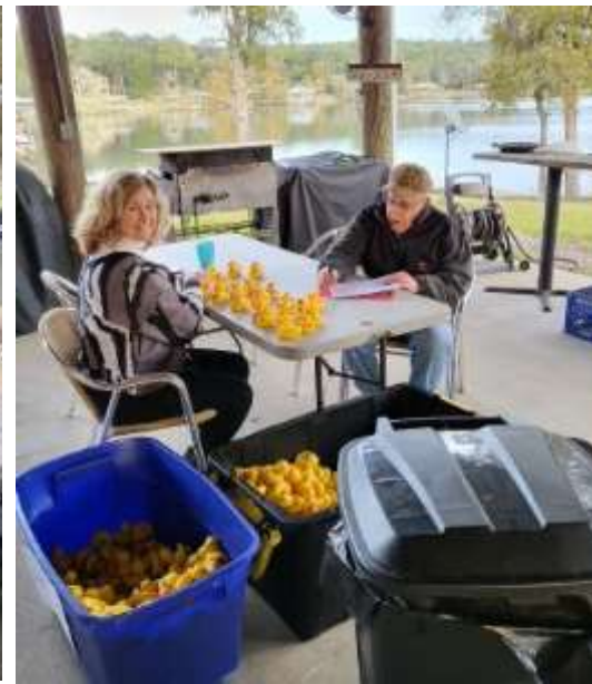
Terra and Vermillion Jack “count” ducks