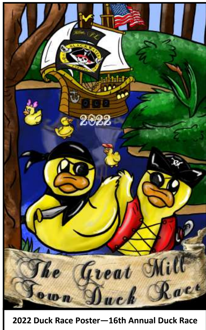
2022 Duck Race Poster—16th Annual Duck Race

Actually, every year around this time, the Pyrates have had a tradition of “counting” the racing ducks. The process includes inspecting each duck to ensure the integrity (ability to float) of the ducks. Additionally, each racing duck number is verified to ensure that we have exactly the correct number of ducks and that each number is properly accounted for.