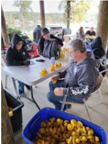
SasSea, 2-Noodles, Scooter, Snookie, Terra and Vermillion Jack “count” ducks

Have you ever wondered how our racing ducks are handled and cared for during the “off-season”?