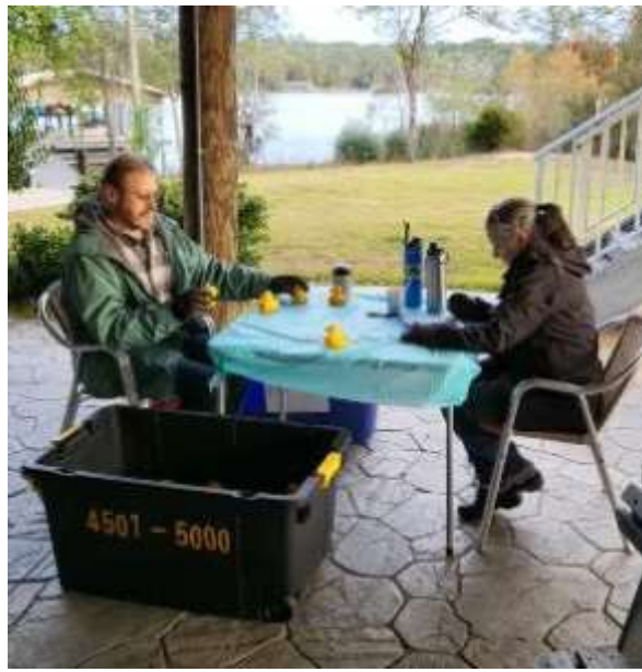
Pepperhead and Flossie “count” ducks