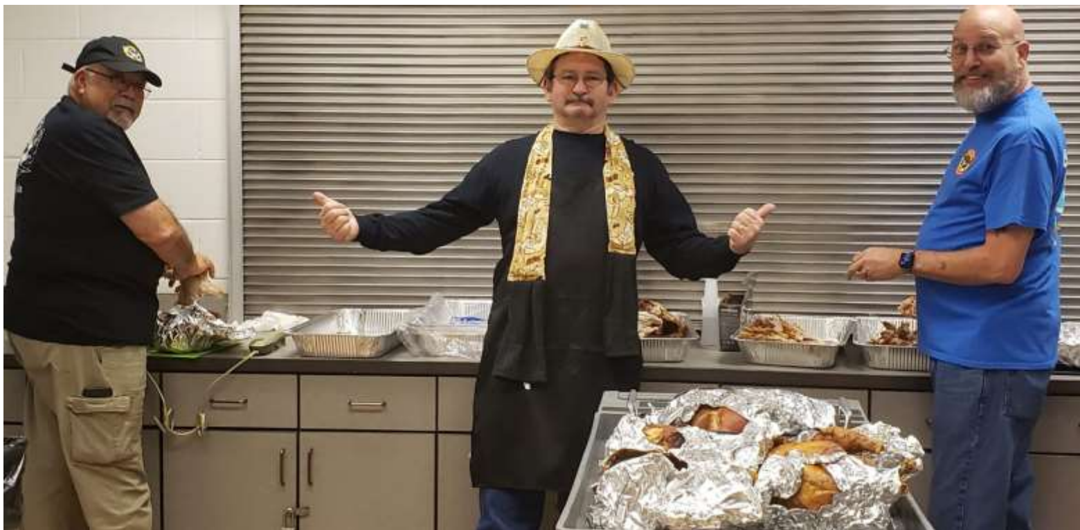
Three Turkeys preparing more turkey for Christmas Dinner