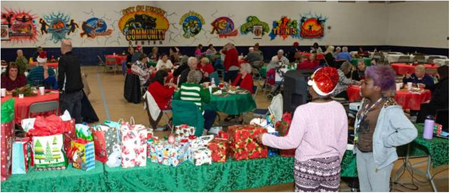
Above and Left: The crowd gathered for Christmas dinner, socializing and Bingo at the annual Santa Rosa County Extension Services Christmas Dinner at the Milton Community Center.