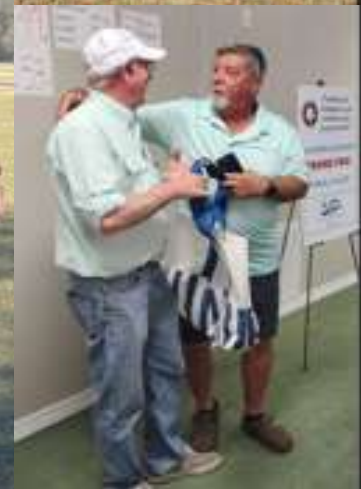
Top: At our March meeting we recognized 9 new Pyrates and 2 from a couple of months ago, get to know our new Pyrates and show them the ropes. Bottom: The Blackwater Pyrates support the Milton garden Club and they in turn are supporters of the annual golf tourney sponsored by the Santa Rosa Chamber of Commerce, the Pyrates sponsored a hole and were able to adopt ducks to the golfers, looks like some of the Pyrates were goofing off but that is to be expected!!