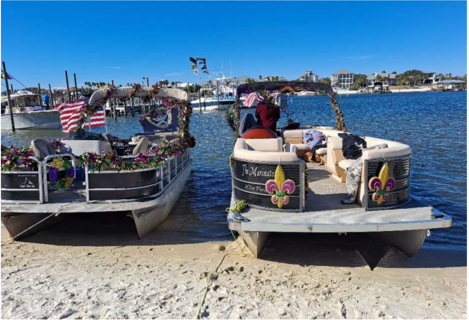
Capt Fins Up and Capt Lucky beached at The Flori-Bama at the end of the Mardi Gras Flotilla