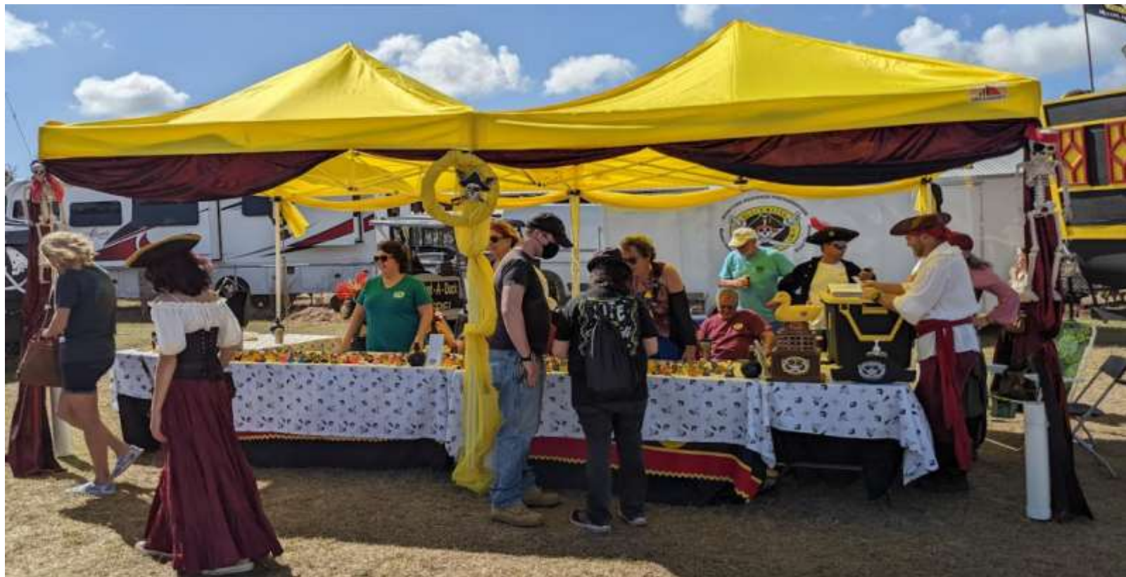
Blackwater Pyrate volunteers work the 2022 Renaissance Faire adopting out ducks for the 4th of July Event

Well, it is Duck Adoption time again. This year like last, we started our season off with the Renaissance Faire at the Santa Rosa County Fair Grounds. And it was a huge success!