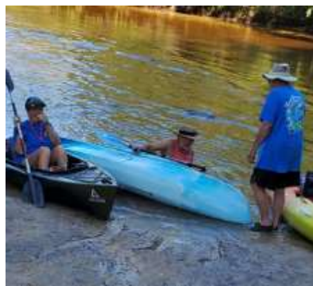
Lesson 2, getting back on the kayak