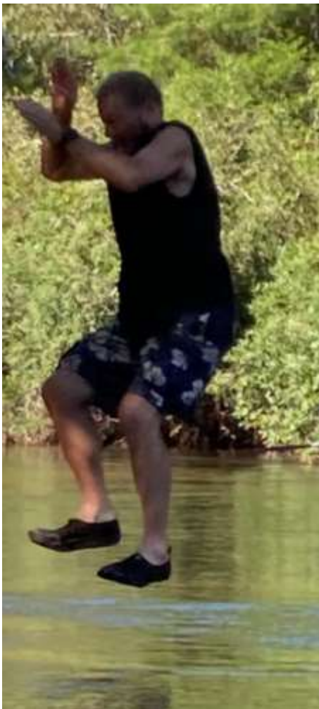
Pepperhead cooling off in the river