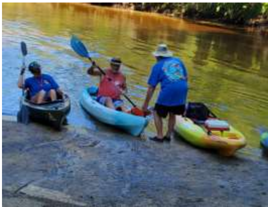
Leatherneck teaching Capt Lucky about Kayaks

Without a great group of volunteers, none of the Blackwater Pyrates missions could be complete. The Upper River Clean Up is no exception. Pyrates with a Purpose!