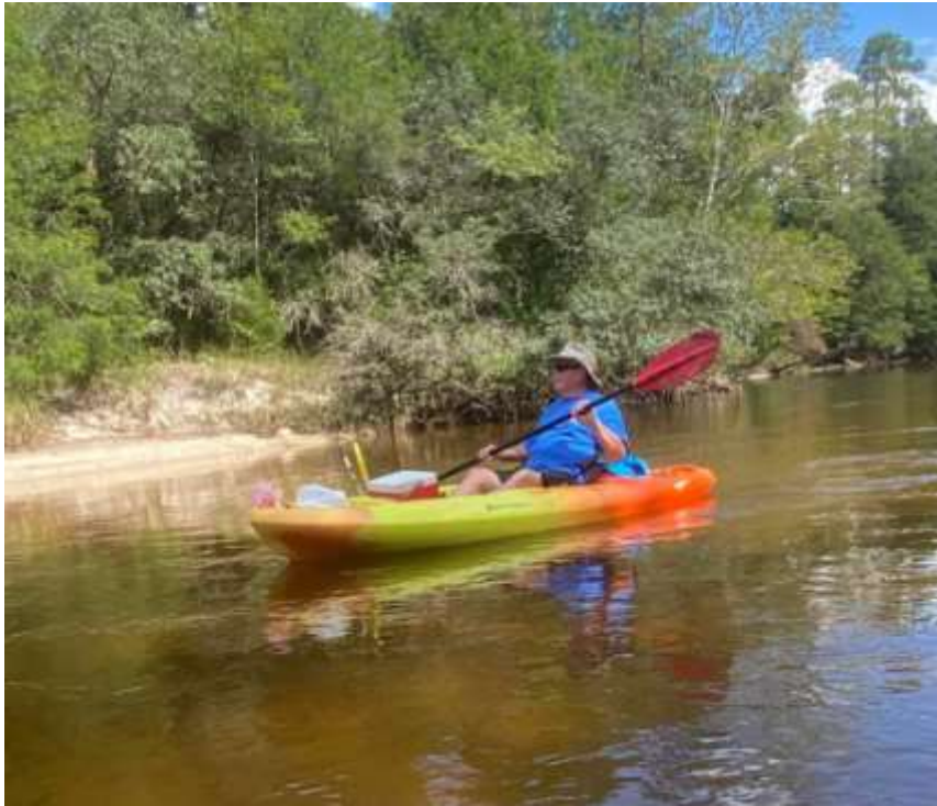
Leatherneck showing the way an experienced kayaker leisurely flows with the current