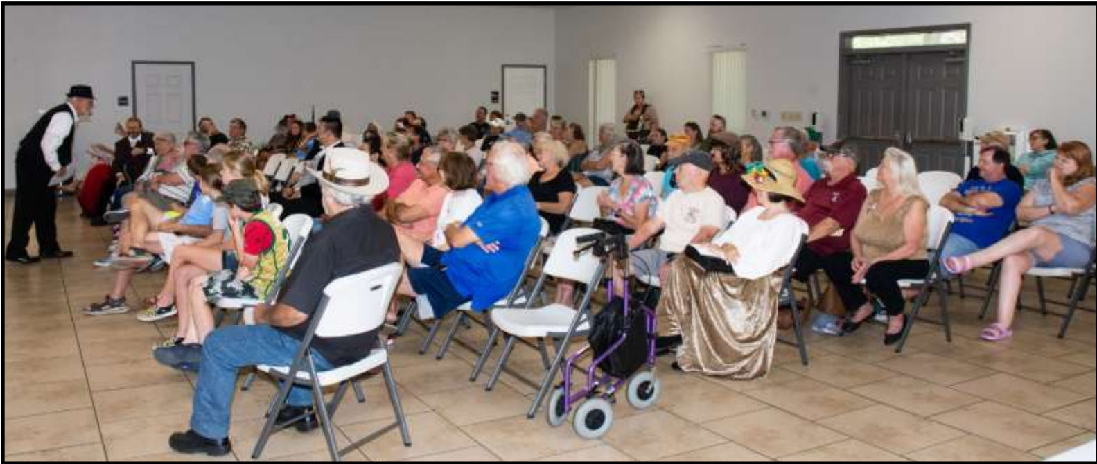
The Blackwater Pyrates captivate the crowd at the Bagdad Community Center

On Saturday, September 24th, the Blackwater Pyrates continued the tradition of entertaining the local community with a Historic Presentation. Almost 20 Pyrates, dressed in Antebellum era attire, gathered to present the “Lost Industries of the Blackwater River Area.”