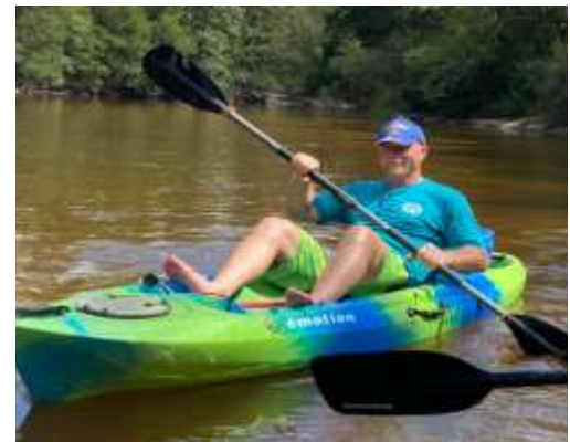
Long John Silver enjoys the day