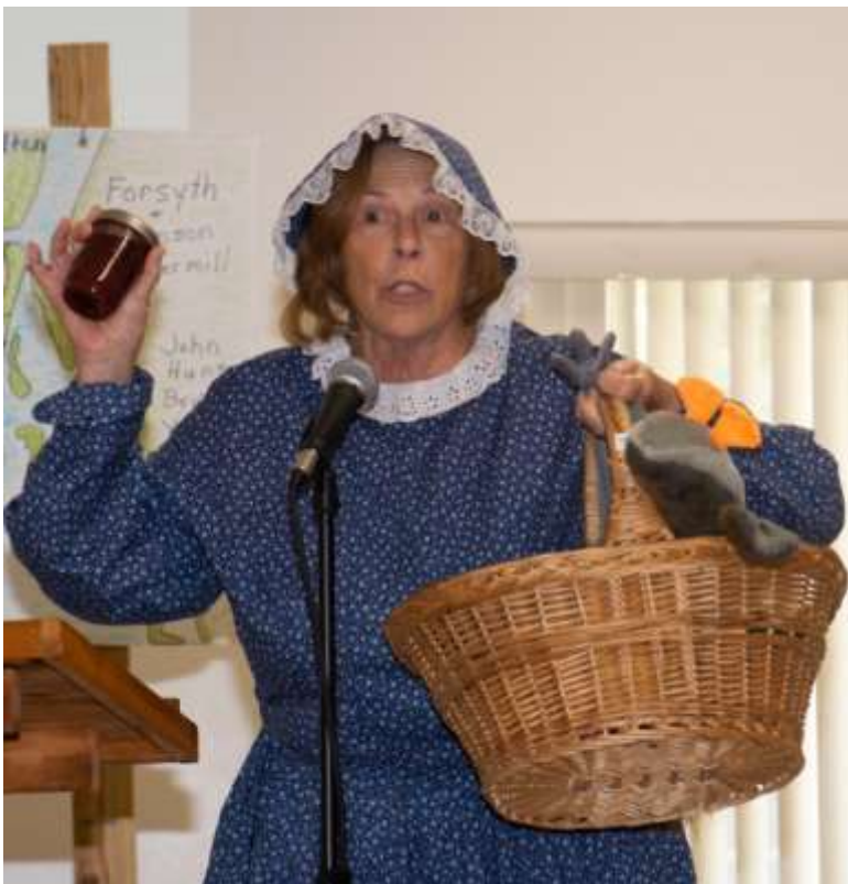
Bottom Left: Store Owner (Lady Mary), Right: Preacher (Prickly Pear)