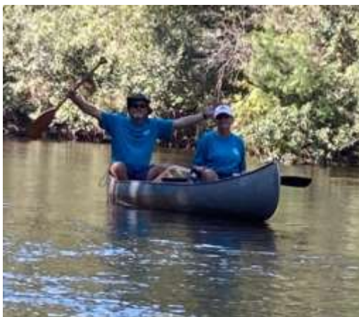
T-Bone and Honey Badger...now you're just showing off!