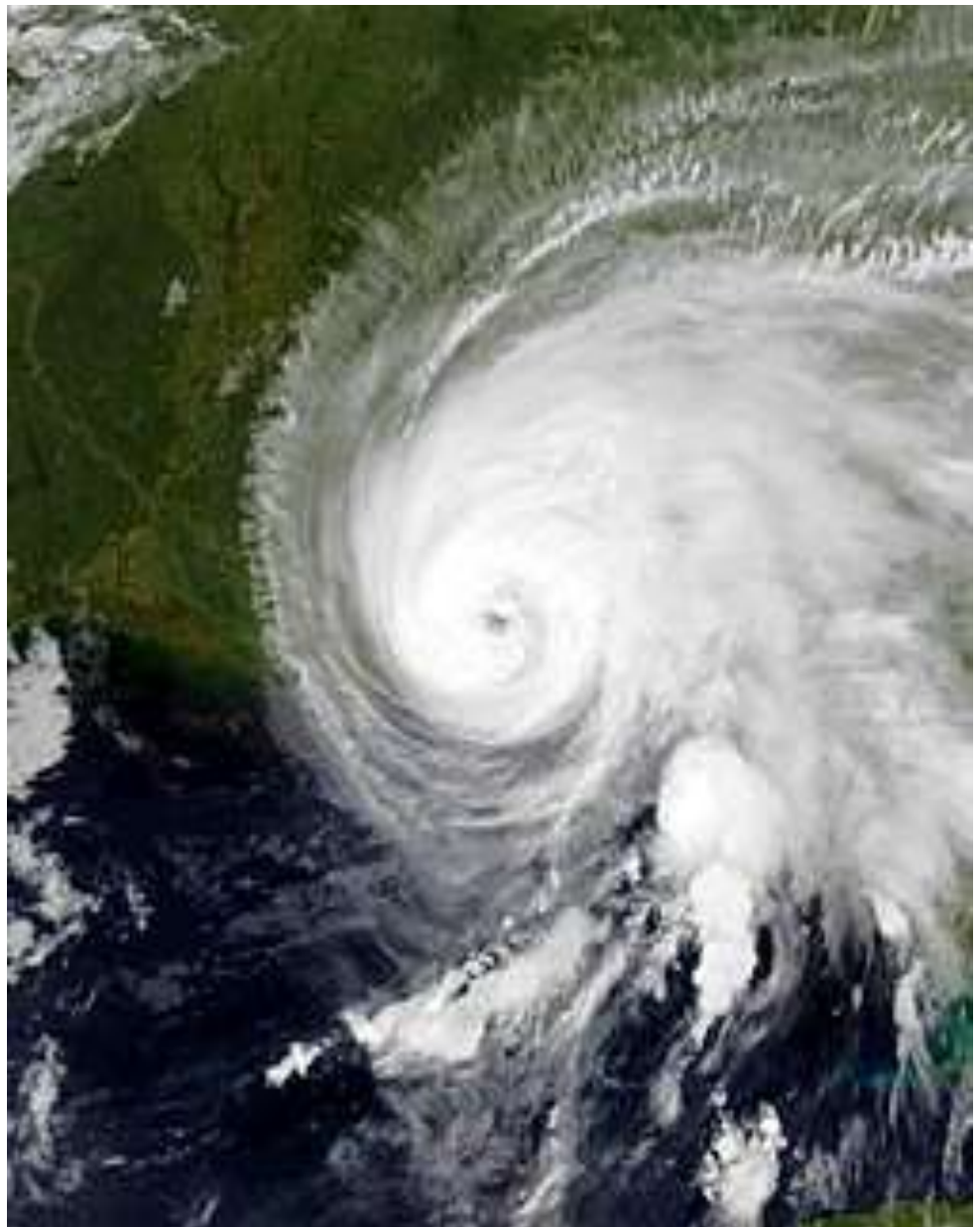
Satellite view of Hurricane Sally as it makes landfall in 2020

Over the past couple of years, Mother Nature has sort of created obstacles for us. Specifically, in 2020 hurricane Sally came ashore just west of us in Gulf Shores, Al. Although only a category 2 hurricane, Sally created plenty of concern in our area with excessive rain and winds. Although not really Pirate-like, the Blackwater Pyrates determined that we should act safely and responsibly and chose to delay the clean up for another year. The 2021 Atlantic hurricane season was the third most active on record, producing 21 named storms and becoming the second season in a row in which the designated 21 name list of storm names was exhausted. These storms created a major disruption in the water level and current intensity on the Blackwater River. Another “wash out” for Upper River Clean Up.