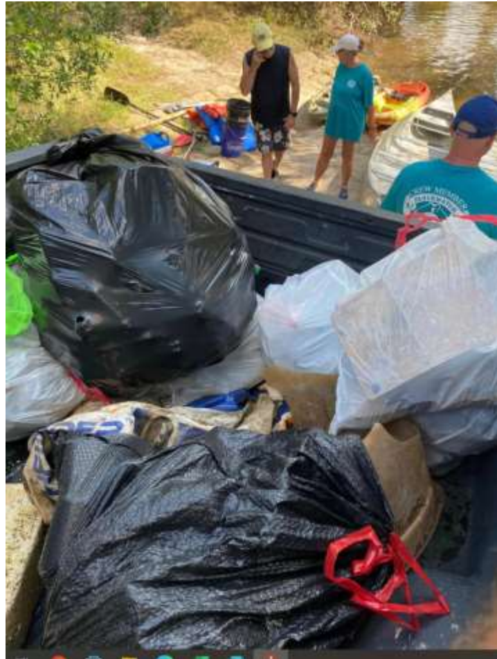
A truck load of trash is removed from the river