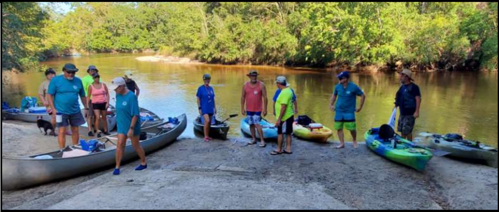
Pyrates inspecting their vessels and receiving a Safety Briefing before the Upper River Cleanup