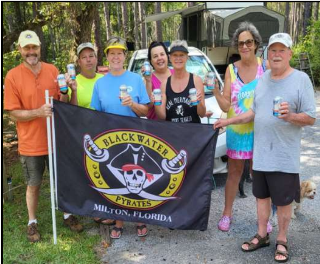
Pepperhead, Capt Murky, Bear Claw, Sandy Bottom, Devil Rae, SasSea and Leatherneck prepare to camp at the Blackwater River State Park

Consequently, the 2022 Upper River Clean Up became the first to be completed in the last 3 years. And what an event it became. We had 4 trailers/RV's occupying 5 campsites at the Blackwater River State Park. 10 Pirates spent the evenings around the campfire telling stories of days gone by. There may even have been a little alcohol involved.