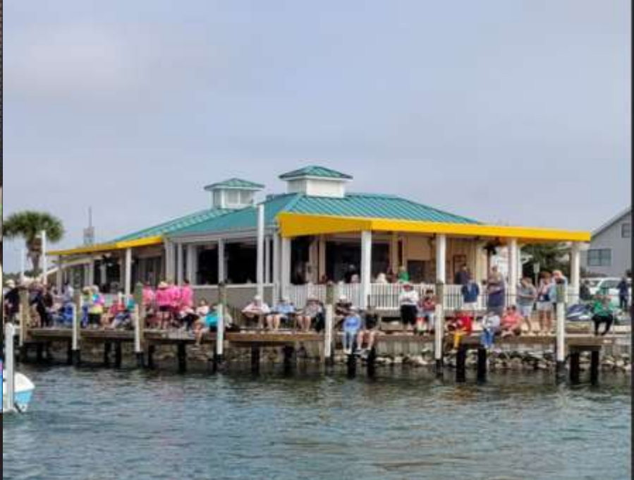
Top Left: Rumfront, Sea Ray and John E Smoke and Colorado High! Top: Some of the crowds at the POLT parade in Perdido.