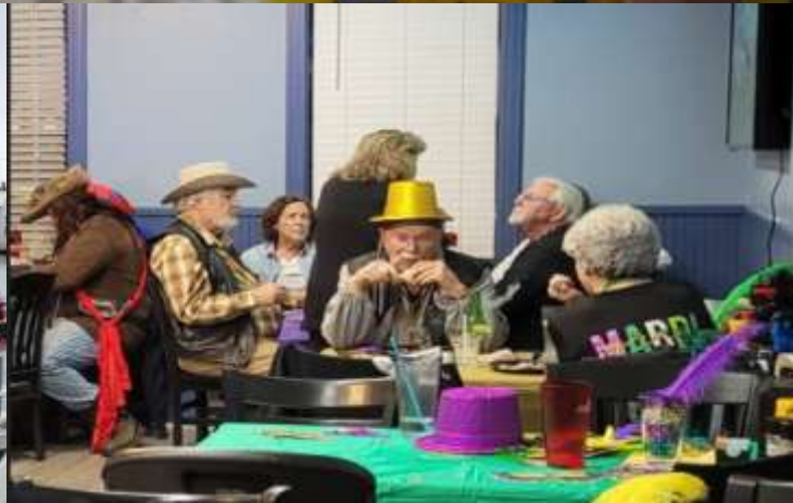
Left: Captain Fins Up and his Motley Crew riding in to toss beads.