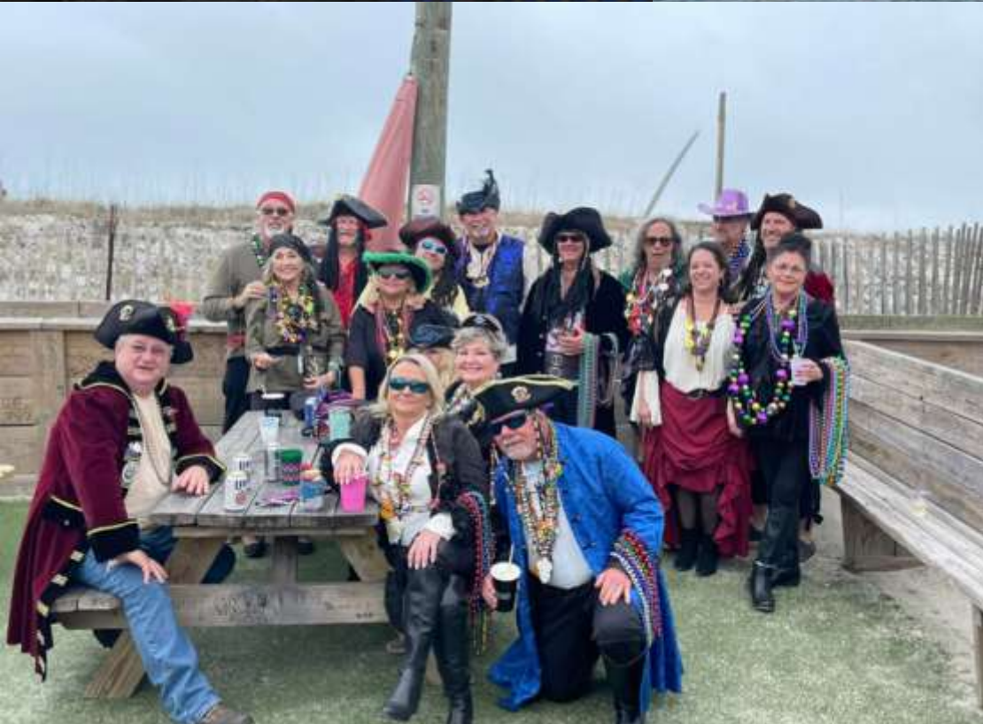
Left: The Blackwater Pyrates after storming Floro Bama!! Great music, bushwhackers and cold grog!! Bottom: The Margherita Boat and Captain Fins Up!