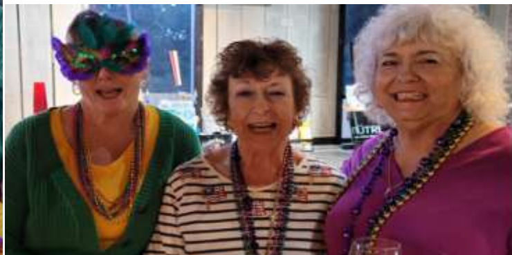
Left: The Karaoke Crew! Pirates enjoying the evening. More Pirates at the Mardi Gras Party.