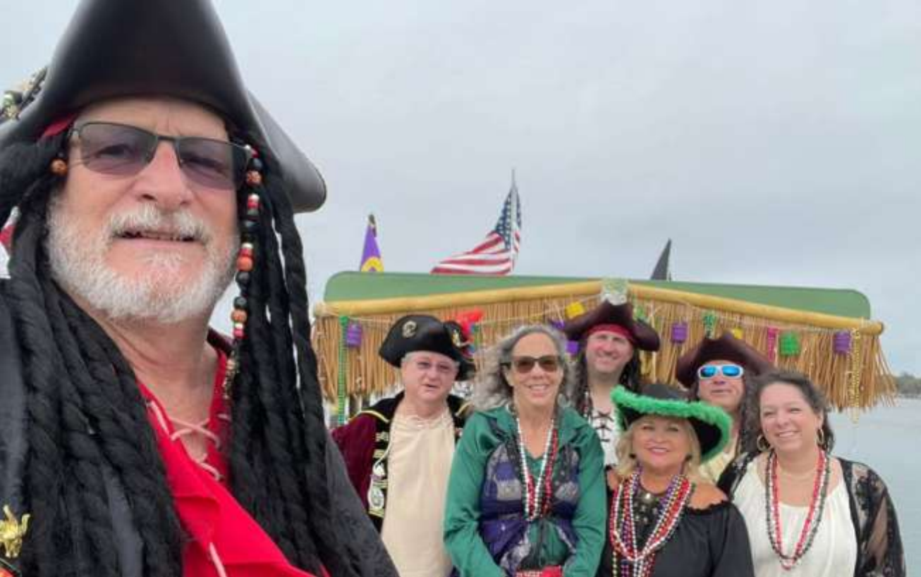
Raiding the Flora Bama Lounge during the Pirates of the Lost Flotilla after party!