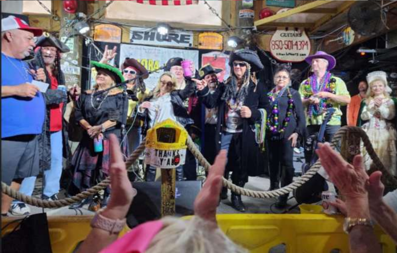
I think Captain Boot took over the stage and proclaimed Blackwater Pyrates owned the place now!!